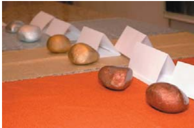
SILVER, GOLD, AND BRONZE DELUSIONASL BOULDER AWARDS

nary sensations and experiences. Dr. Grof gives the babbling accounts of doped hyperventilators the status of reality; he deduced from them even the concept of Cosmic Consciousness. According to Grof, human consciousness can through the change of Ph of the blood detach from the body and transport to one of the past lives or to the time of biological birth. Dr. Grof is also the cofounder of a “canine–feline (dog–cat) discipline”—transpersonal psychology—which is trying to unite science and spirituality.